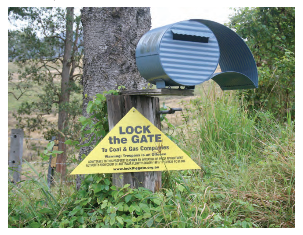
Figure 1. Lock the Gate Alliance triangle secured to property entrance

KNAG is socially and politically motivated, but not aligned to any political party. The group is closely affiliated with the Lock the Gate (LTG) Alliance, whose members seek to prevent massive industrialisation of the rural landscape of the Northern Rivers by UGM ventures. A close connection with the LTG Alliance is referenced through KNAG's use of the LTG Alliance logo of a yellow triangle superimposed with black text. This is used on banners at knit-ins and on a variety of knitted objects. Local property owners wanting to make clear their affiliations have attached LTG Alliance triangles to entrance gates, fences or trees on the perimeters of their land.