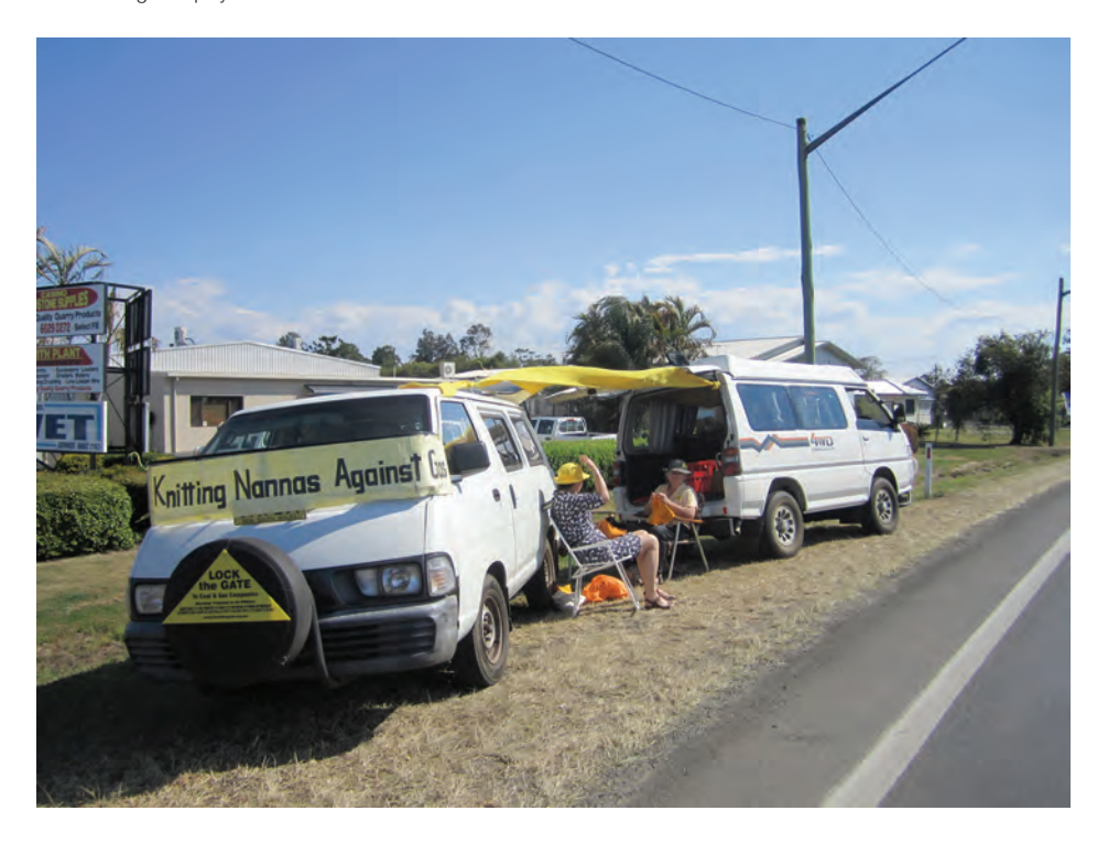
Figure 13. Knitting on the road verge outside the Metgasco office, Casino