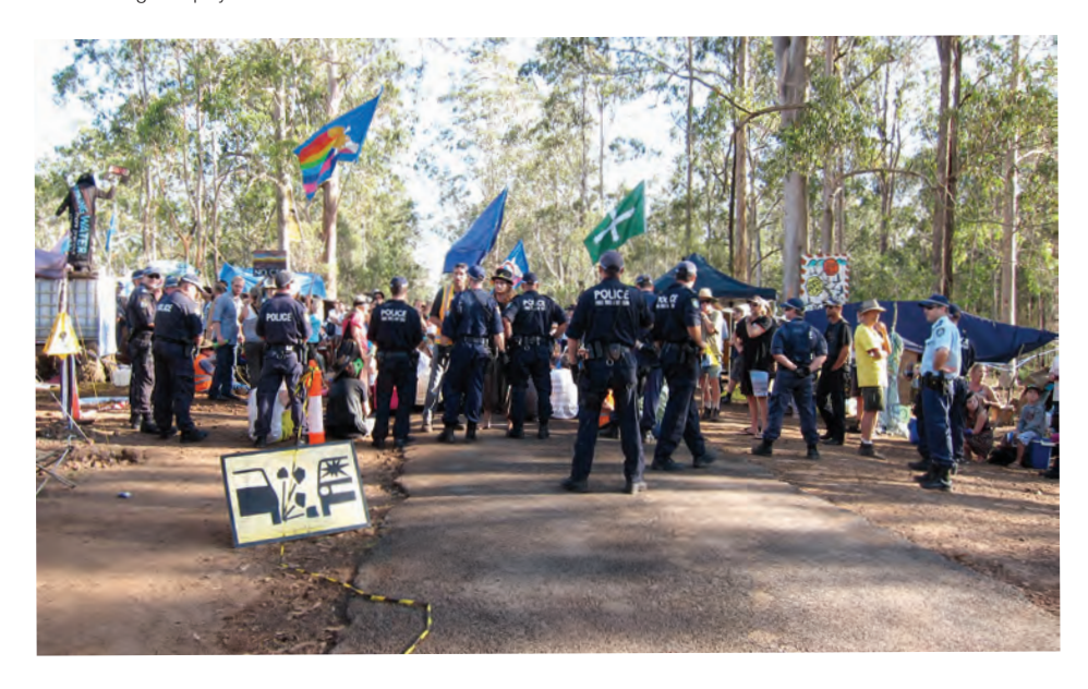
Figure 11. View of Glenugie blockade