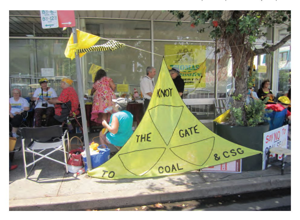
Figure 10. KNAG banner