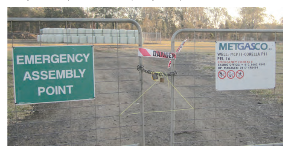
Figure 3. Yellow yarn triangle on Metgasco gate

An artifact was always left behind during these excursions as a reminder that company undertakings were consistently observed and recorded. Usually this would take the form of a yellow yarn triangle that echoed the LTG Alliance version, arranged as if to prevent workers opening the depot or well-site entrance.