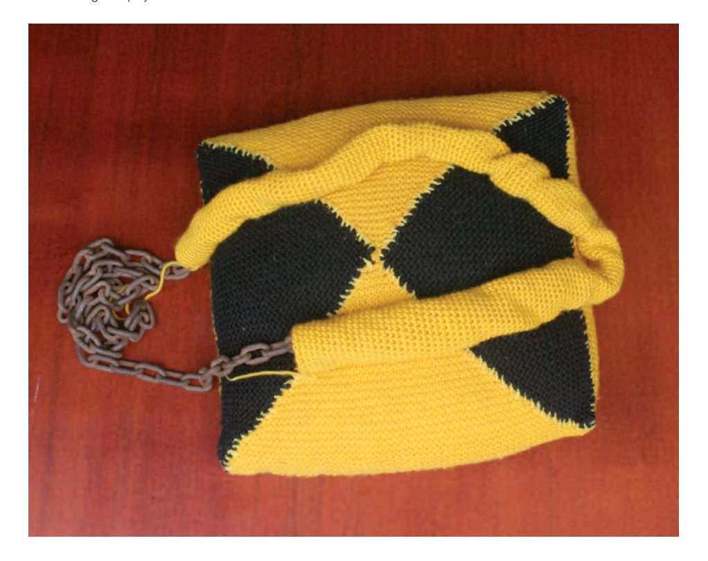
Figure 7. Cushion and chain sleeve; lock-on comfort provided by KNAG Photo: Liz Stops 2013

In June 2013 at Parliament House in Canberra, the entrance to the building was temporarily blocked by anti-UGM activists, including a few Nannas, effectively closing down the main entrance to the nation's seat of power (Carroll 2013). As they arrived, politicians who had been vocal against UGM were offered a KNAG hat. Knowing the implications, and due to a strong media presence, some refused. Christine Milne, Leader of the Australian Greens, Larissa Waters, an Australian Greens Senator, and Bob Katter, leader of Katter's Australian Party, however, accepted the gift and, therefore, the association with KNAG and the subsequent publicity.