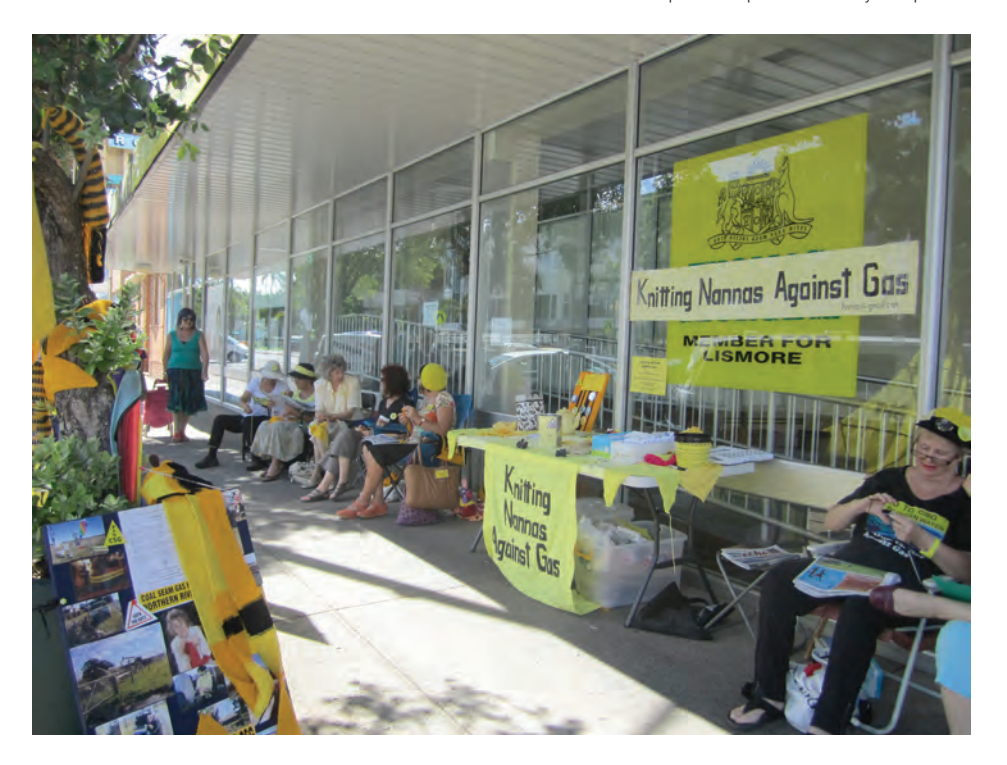
Figure 14. Nannas outside Thomas George's office

The opportunity for community engagement at that site has been maximised by distributing information to, and engaging in discussion with, passers by. According to Black and Burisch, the 'interactions and discussions that take place during group knitting also act as an accessible forum for teaching, sharing, and promoting activist strategies and politics' (2010: 611).