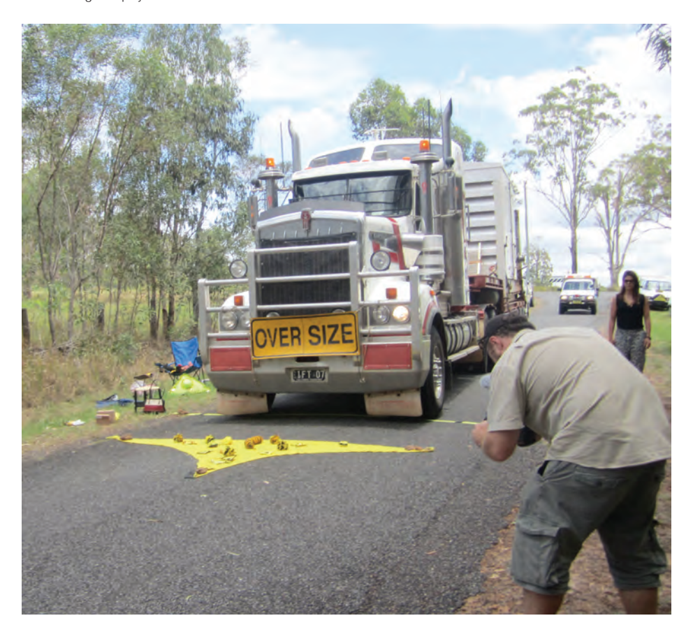
Figure 4. Metgasco truck with heavy equipment running over soft barriers

The same barrier, having grown considerably longer through a succession of knit-ins, was draped on a tripod installed over an entrance gate to a projected drill site at Doubtful Creek in February 2013. Here, Twomey sat atop the tripod knitting and filming while 300 blockaders below her attempted to prevent the passage of a truck bearing a drill rig. Charged by police, but subsequently acquitted, her tripod, including the knitted length, was bulldozed once police had cleared the area of people. Twomey's torn and muddy knitting, however, was rescued from the bulldozed pile and now acts as a 'memory cloth' (Gordon 2011: 212), a marker and reminder of a significant event. Describing how a 'tear or rent in the social fabric' can be 'a tactile metaphor for a collective trauma or destruction'. Pajaczkowska notes also the 'reparative functions of darning, patching and mending' (2005: 240). Twomey, however, seeing no reparation, has resolved to leave the knitted length unmended until mining companies leave the area and the social fabric is restored.