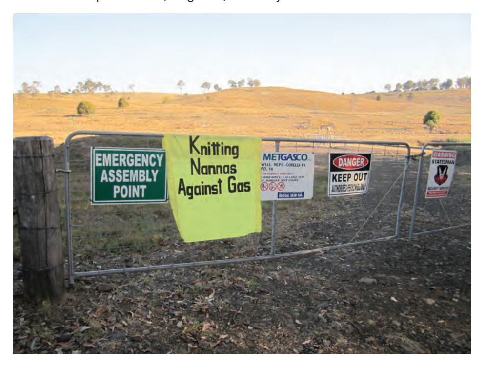
Figure 2. KNAG banner on Metgasco fence

Pajaczkowska, drawing on the work of Levi Strauss, discusses weaving in terms of 'transforming the "raw" material of nature into the "cooked" language of culture ... animal hair or vegetable fiber is transformed into a medium for human relationship' (2005: 233). Knitting can perform the same function. For instance, the VKP sought to 'incorporate knitting as protest into knitting as communication' (Robertson n.d.). Similarly, in maintaining vigilance, KNAG uses both the act of knitting and the objects knitted to calmly and peacefully communicate persistence, diligence, solidarity and determination.